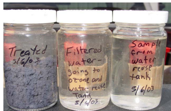
Jars from Batch Treatment System at a corrugator with 100% water reuse