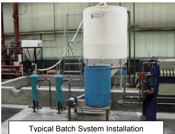
Typical Batch System Installation

Sump Pump pH Adjustment System Effluent Sampling Tank Automation Water Reuse System Ozone Treatment System Access Platform Final Filters