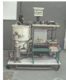
Portable 250mm Pilot Press