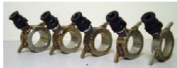
Lab Cake Sizes available from .75" to 2.00"