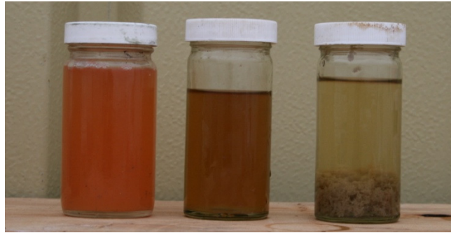
Untreated, Treated and Flocked Samples

The picture below shows samples for untreated (left), Treated (middle) and Treated & Flocked (right). The sample in the middle is treated water that was taken from the secondary clarifier effluent which drained to the City sewer. The sample on the right was from the secondary clarifier effluent and treated with Floccin 1105 to look at further reduction of the BOD and TSS levels.